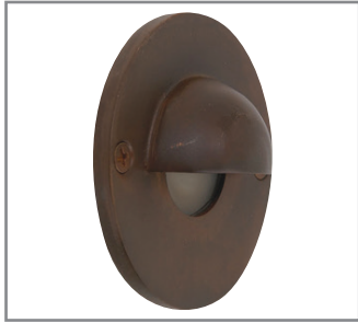
Model: SPJ-FB-275-3 Finish: Matte Bronze