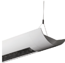
Optional Decorative End Cap (SPE)