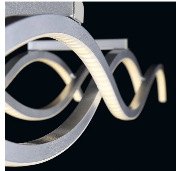
6' Max Cable Suspension