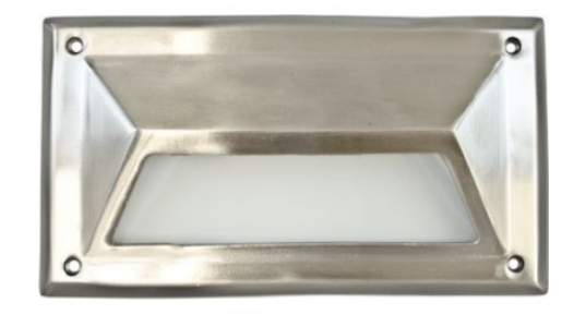
Shown in Stainless Steel