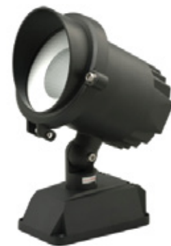
Shown with Visor