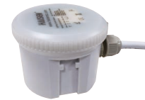
MS - Motion Sensor (Optional)