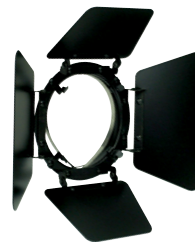
BB/WB Black/White Barndoor Accessory