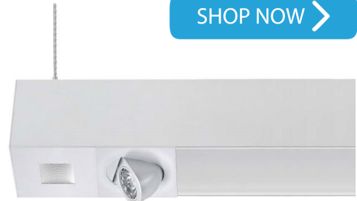
Spot Light (Outer)