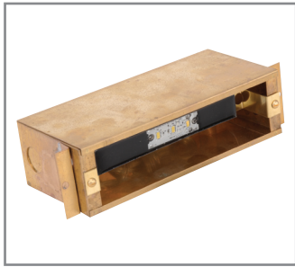
Model: SPJ17-FB-LG-BOX-QS Finish: Raw Brass