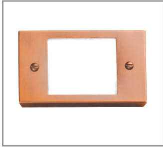
Model: SPJ17-05-QS Finish: Matte Bronze