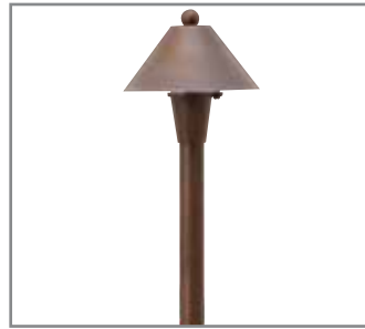
Model: SPJ10-03 Finish: Matte Bronze