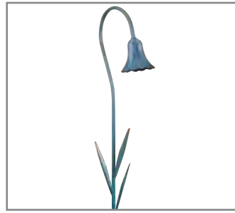
Model: SPJ08-01 Finish: Verde