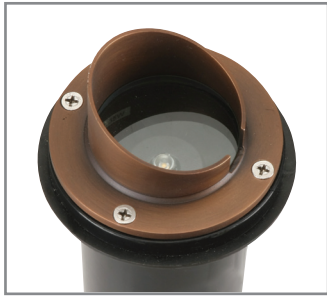
Model: SPJ-MW1000-P-SH Finish: Matte Bronze