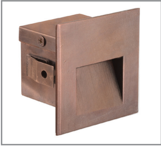
Model: SPJ-MSL2-QS Finish: Matte Bronze