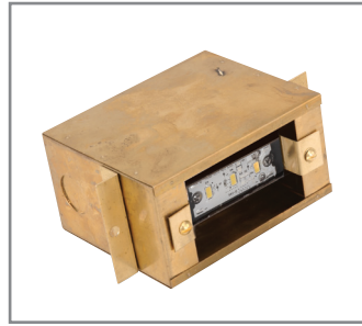
Model: SPJ17-FB-SM-BOX-QS Finish: Solid Brass