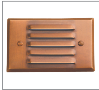
Model: SPJ17-06-QS Finish: Gun Metal