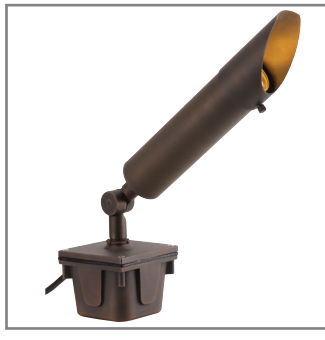
Model: Mr. Big