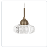
PD56505-VB Vintage Brass

Single and multi-pendants available in three different glass shapes, the possibilities are endless. You can choose between tulip, malt and lantern to compliment your space. The glass diffuses the light to enhance the warmth in your room.