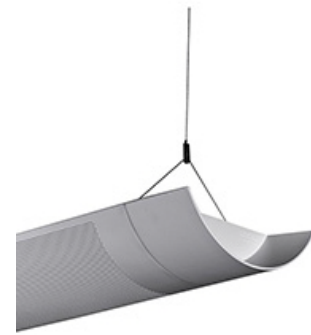
Optional Decorative End Cap (SPE)