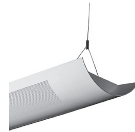
Optional Decorative End Cap (SPE)