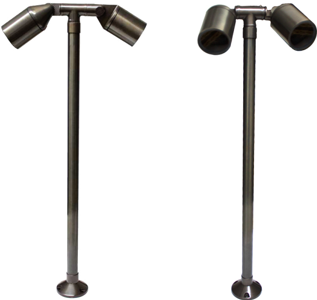
Vertical Direction Fixtures face outwards