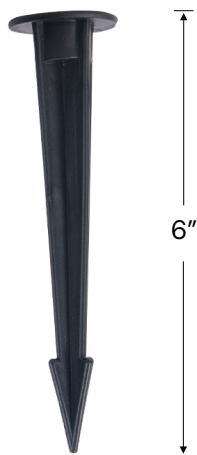
6" ABS Ground Spike, Black INCLUDED