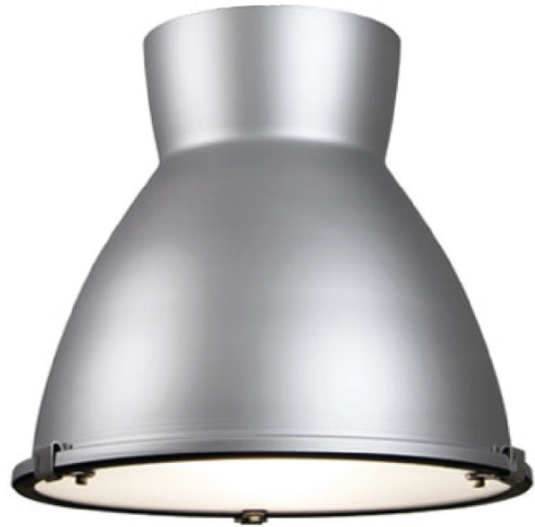
15203 shown with EM option