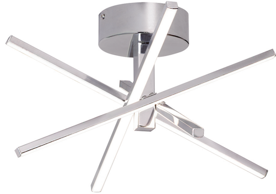
Polished Chrome Finish

Listings: cETLus listed for indoor damp locations