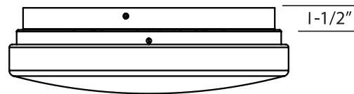
Optional Emergency Battery