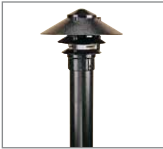
Model: SPJ12-07 Finish: Powder Coat Black