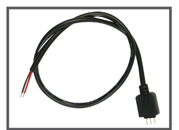
ELB-HWC-12 (12 inches) ELB-HWC-24 (24 inches) ELB-HWC-72 (72 inches)