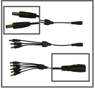
LSA-DCS-2 (2 WAY SPLITTER) LSA-DCS-3 (3 WAY SPLITTER) LSA-DCS-5 (5 WAY SPLITTER)