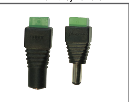
LSA-DCA-M (MALE) LSA-DCA-F (FEMALE)