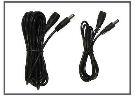
LSA-DCE-40 (40" DC EXTENSION CABLE) LSA-DCE-120 (120" DC EXTENSION CABLE)