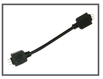
Link Extension Cable