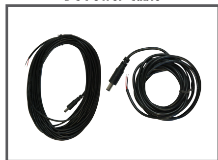
LSA-PWC-8FT (8' DC POWER CABLE) LSA-PWC-30FT (30' DC POWER CABLE)