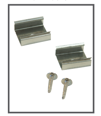
ELB-BKT (ONE SET OF FLAT BRACKETS INCLUDED WITH EVERY LIGHTBAR)